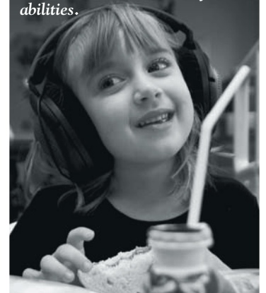
The Listening Program improves concentration and auditory abilities.