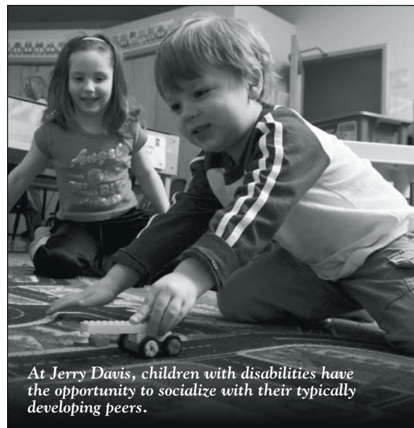
At Jerry Davis, children with disabilities have the opportunity to socialize with their typically developing peers.

school program offers a full-day program five days a week, and gives children with disabilities the opportunity to socialize with their typically developing peers. Daycare services are provided to children from 3 months to 6 years old.