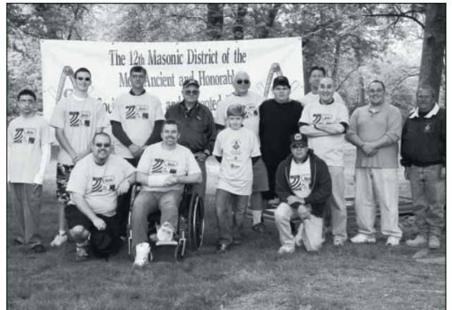
Top Community Team: Free and Accepted Masons, District 12.