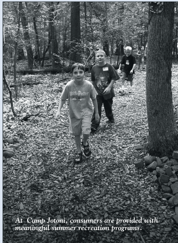
At Camp Jotoni, consumers are provided with meaningful summer recreation programs.

The $5,298 grant from HSBC would be used to save energy and reduce The Arc’s $212,000 energy costs. This would be accomplished by replacing high-bay light