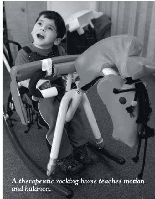
A therapeutic rocking horse teaches motion and balance.