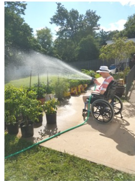
Bountiful harvest at CGGH