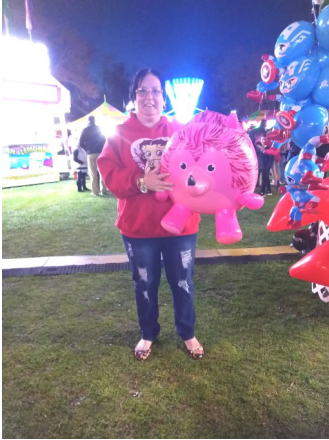
Dorothy wins big at Seaside!