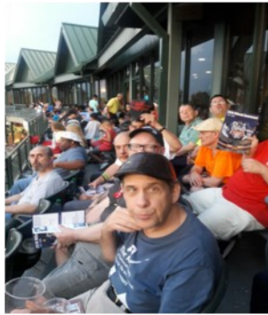
Hot summer fun at Patriot's Stadium