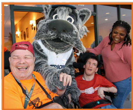
Adult Services Enjoy Additional Recreational Activities in 2016-2017