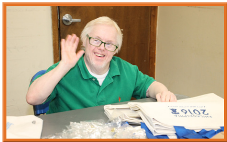
Employment Services Program Continues to Provide New Contract Work