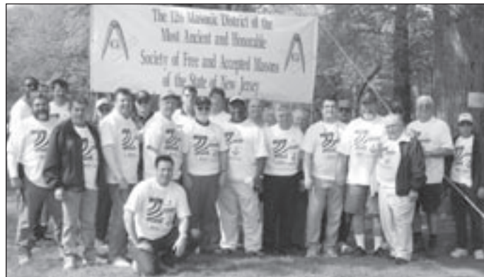
District 12 of the Grand Lodge of New Jersey's Free and Accepted Masons