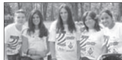
Some of The Jerry Davis Early Childhood Center ArcWalk team