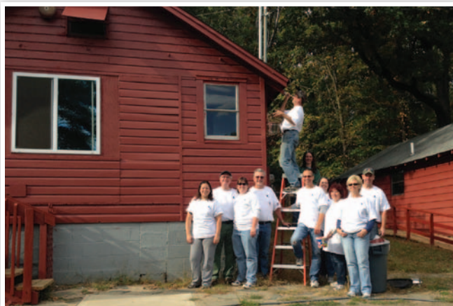
October 9 th – Volunteers from CHUBB came to Camp Jotoni for some exterior painting work.

Companies from the local community shared their time, talent, and supplies during the fall of 2014 to spruce up an Arc group home and Camp Jotoni.