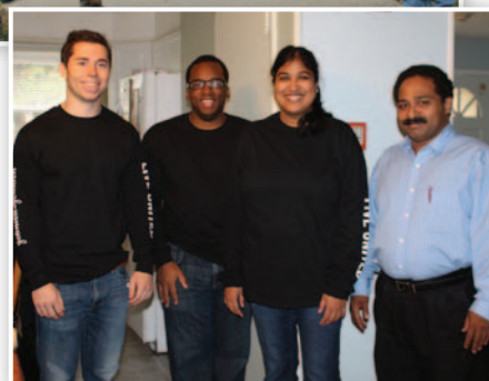
November 3 rd - Volunteer members from Janssen Pharmaceuticals came to Camp Jotoni for some winterization projects to help us close camp for the winter.

Thank you volunteers of Johnson & Johnson, Janssen Pharmaceuticals, and CHUBB!