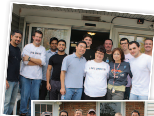
October 16 th - Volunteers from Johnson & Johnson's IT Group painted our Rocky Hill and Cedar Grove Group Homes.