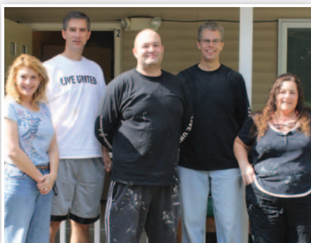
October 21 st – Volunteers from Johnson & Johnson's IT Group also painted our Union Ave. supervised apartments and Warren Group Home.