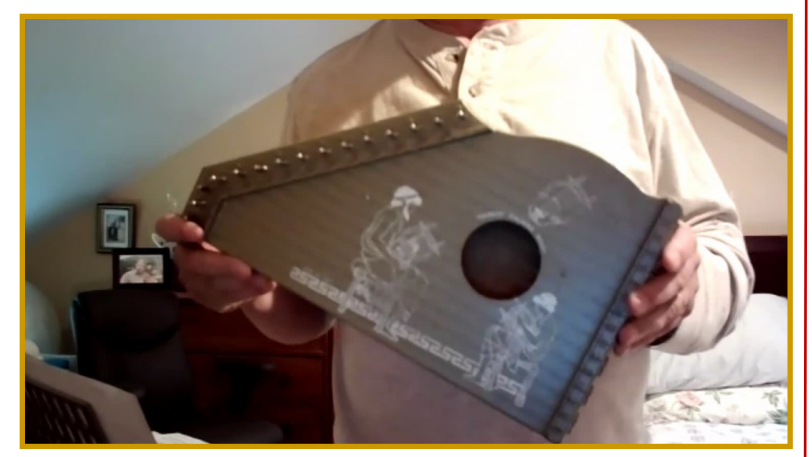
Vinnie's next instrument he wants to learn is called the "Zither"