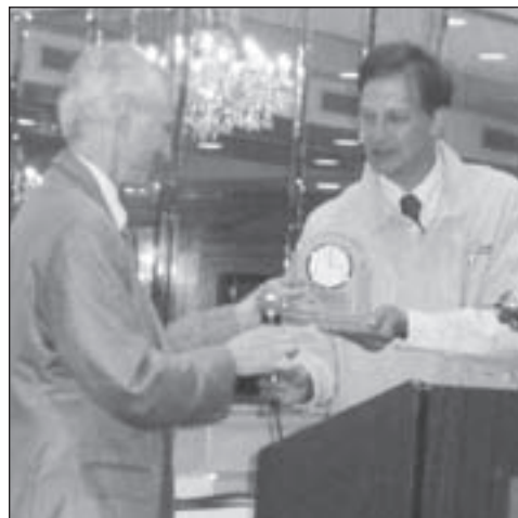
The Employer of the Year Award went to Trimline Medical Products.

Employer of the Year Award went to Trimline Medical Products for its inclusive and supportive employment practices that have led to 10,000 products being produced daily by Arc consumers.