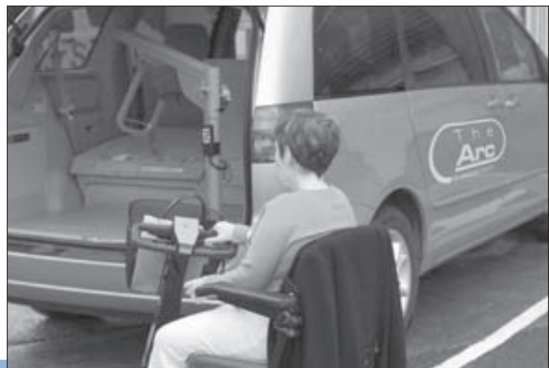
This is a digitally altered stock photograph. The Arc does not currently have this van, but it would be a great help to our consumers.

The Somerset Arc is looking for donations to cover these costs, ranging from $12,000 for sedans to $65,000 for wheelchair-accessible vans. Support in this area would go a long way in assisting Somerset County consumers.