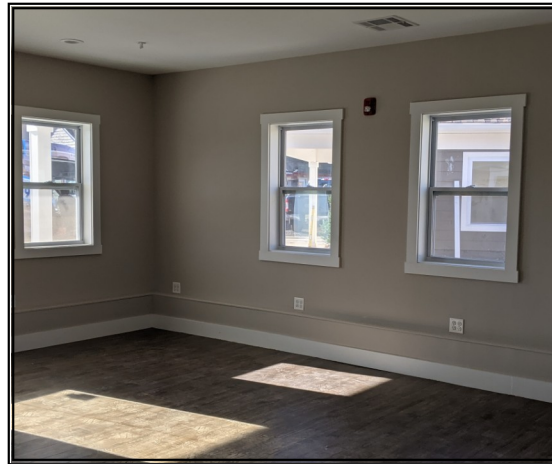
Interior of 1/2 of Cabin 2