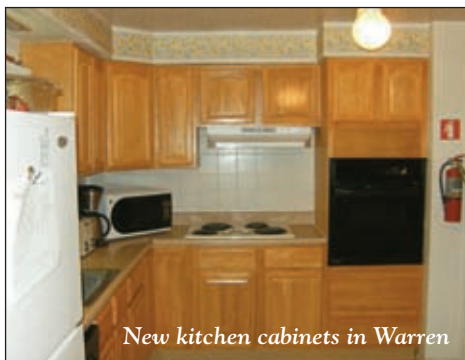
New kitchen cabinets in Warren