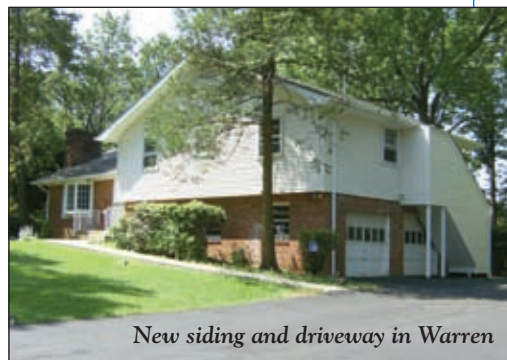
New siding and driveway in Warren