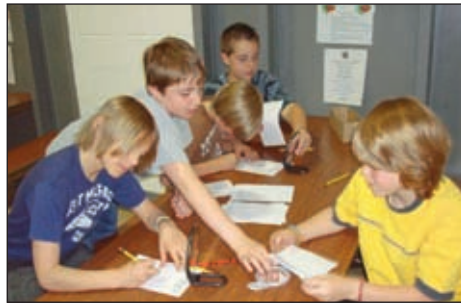
Fifth graders at Apshawa Elementary School