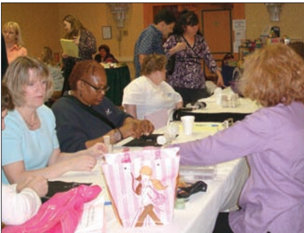
Caregivers enjoy a day of respite.