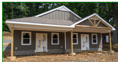
4 New Cabins: