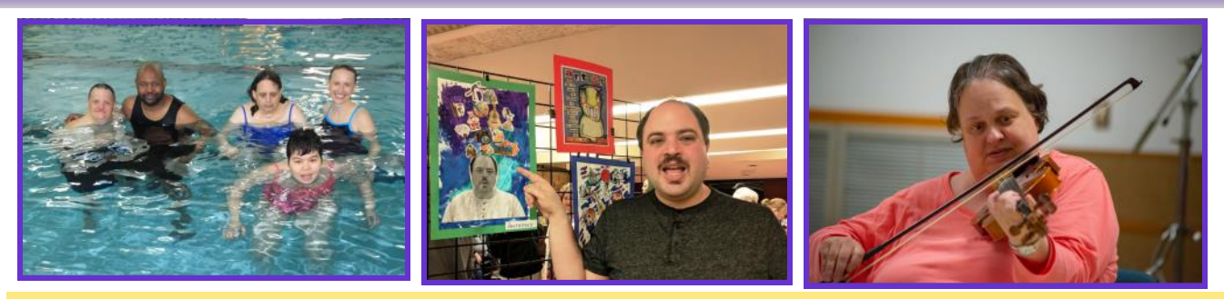
The Arc of Somerset County's Adults Community Inclusion Programs Take Off in 2019

Adult services has been hard at work expanding programming to include new learning for consumers and new community partners. These opportunities allow for exercise, use of civic spaces, volunteerism and more. New programs that have started within the 2018-2019 timeframe include: